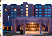
Fully renovated in 2020

Questions? Phone Mary Elemen at 925-759-6555 or email TCIConvention2022@gmail.com Visit the Convention 2022 page on the TCI website: https://www.tall.org/convention-2022.html