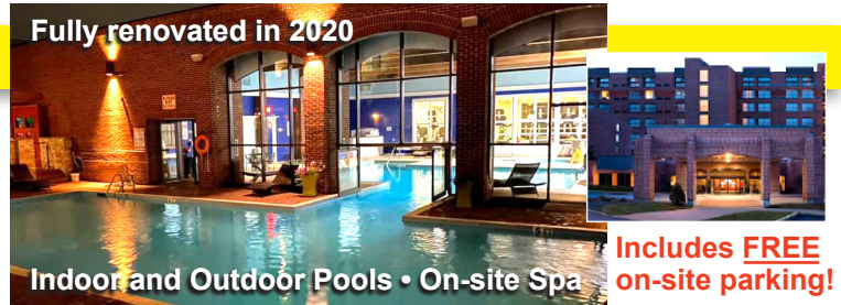
Indoor and Outdoor Pools • On-site Spa Includes FREE on-site parking!

TCI rate is valid June 28–July 14, 2022. Hotel Room block to be released on June 1, 2022 at which point reservations will be based on availability.