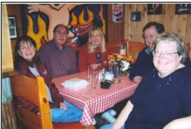
Day after Thanksgiving at Famous Dave's, then Quivey's Grove