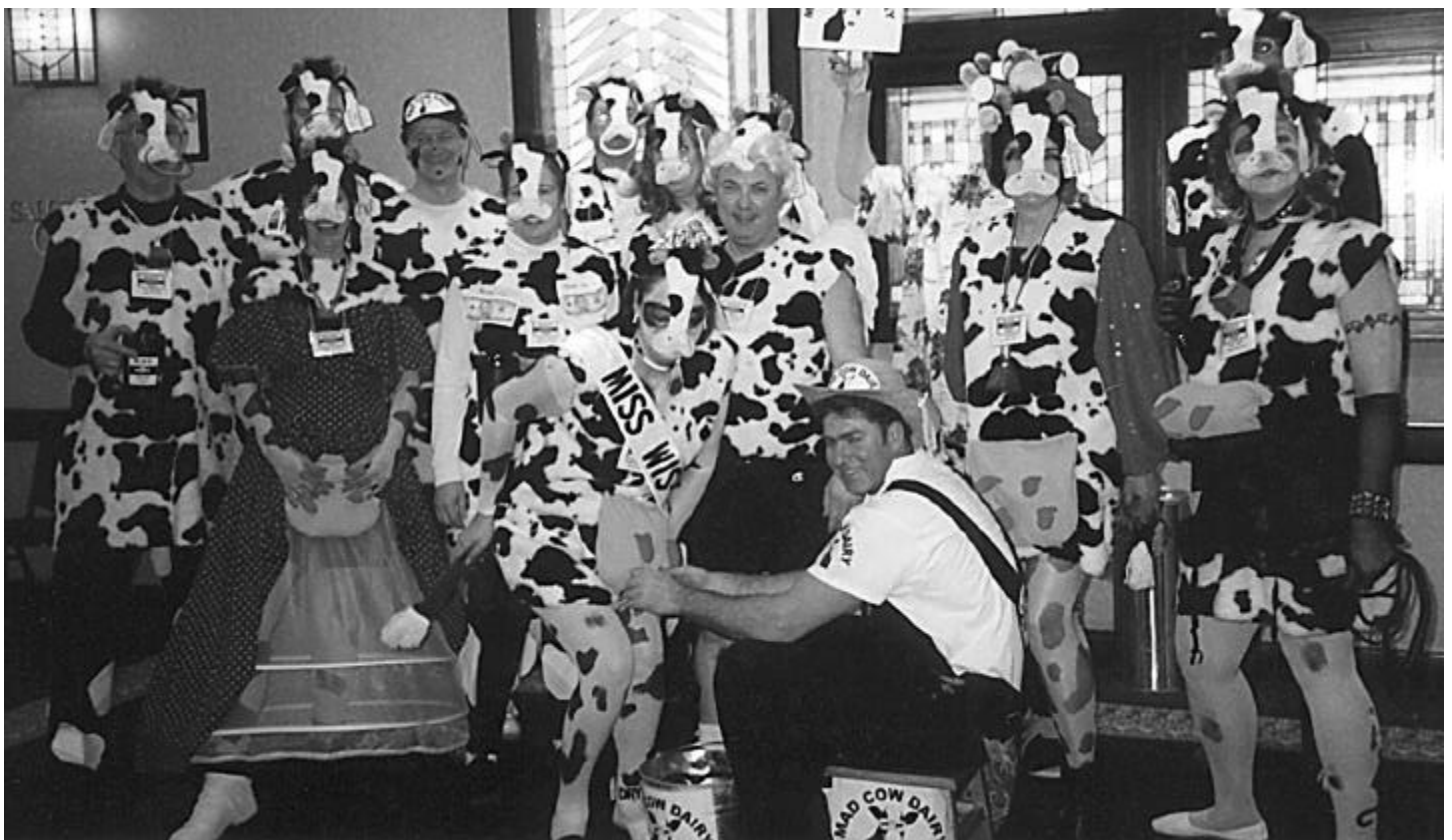
The Mad Cow Dairy Herd:at Chicago's weekend