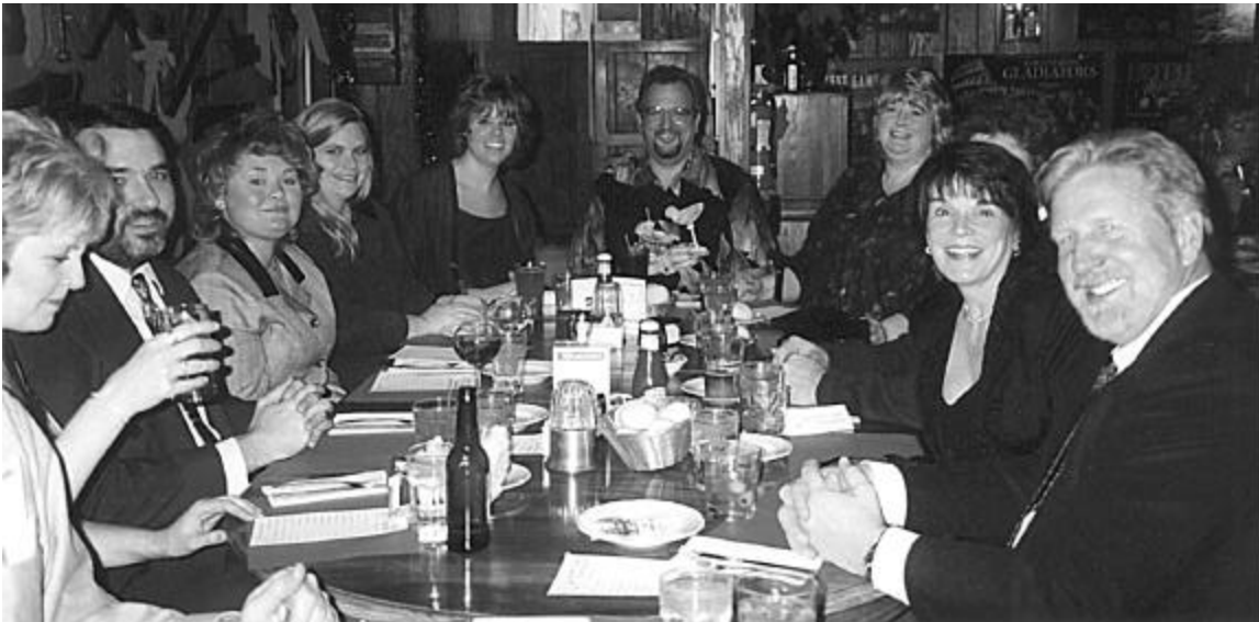
A partial shot at dinner.