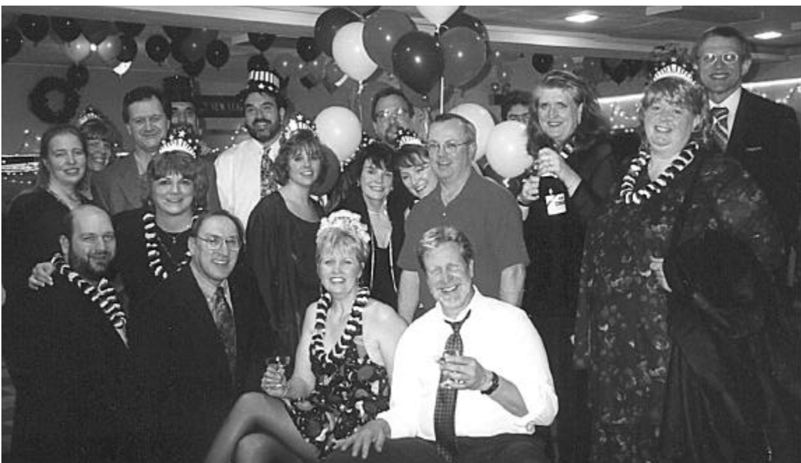
The group shot New Year's Eve: